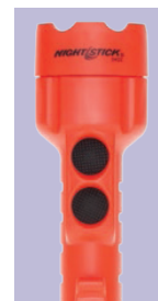
Dual body switches