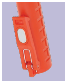
Built-in pocket/belt clip with integrated magnet