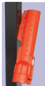
Hands-free magnet in clip