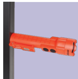
Hands-free magnet in base