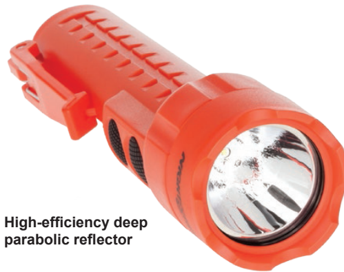
High-efficiency deep parabolic reflector